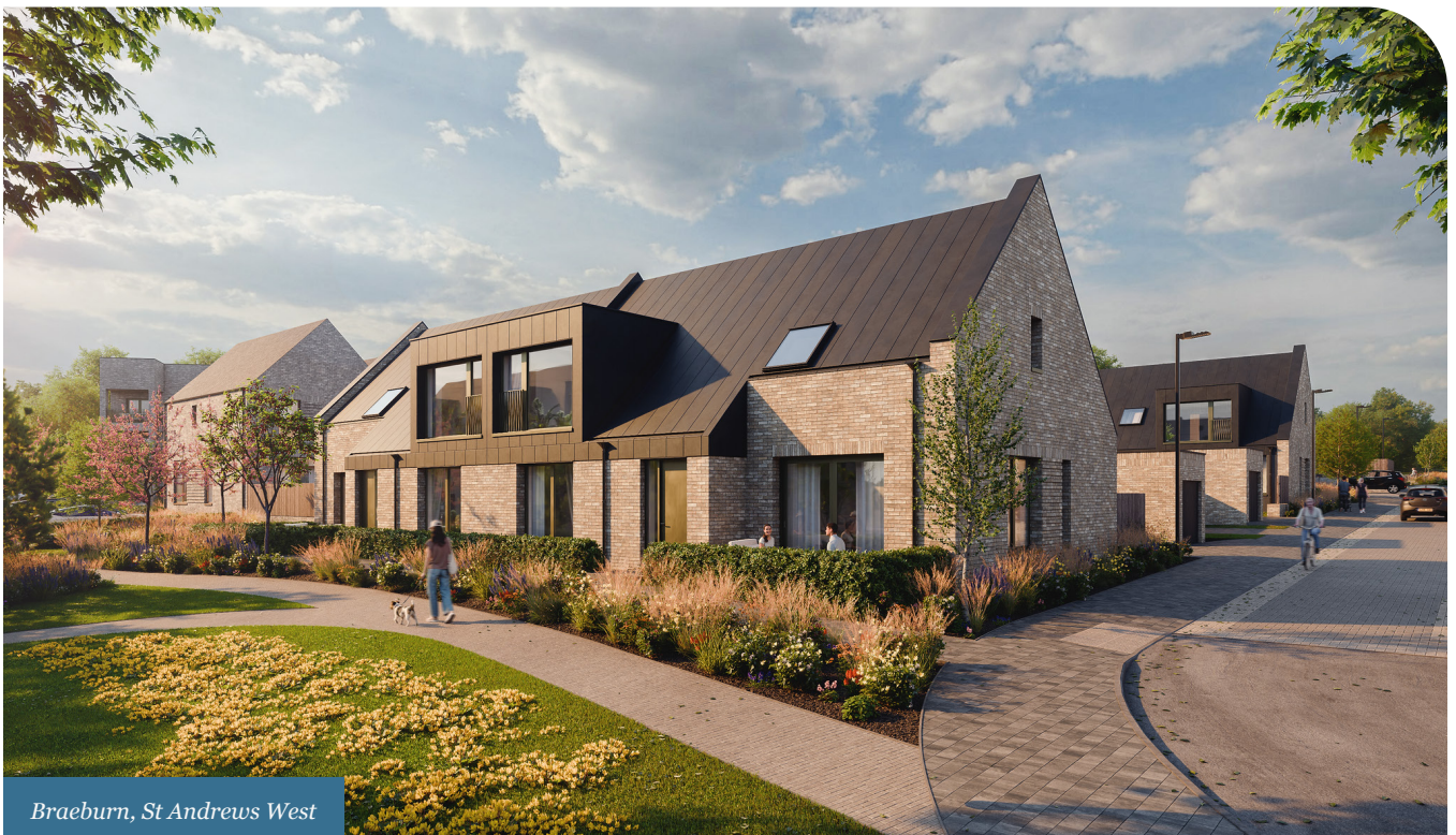
Braeburn, St Andrews West