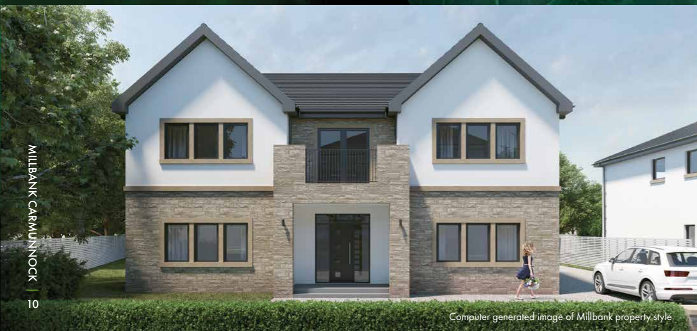
Computer generated image of Millbank property style