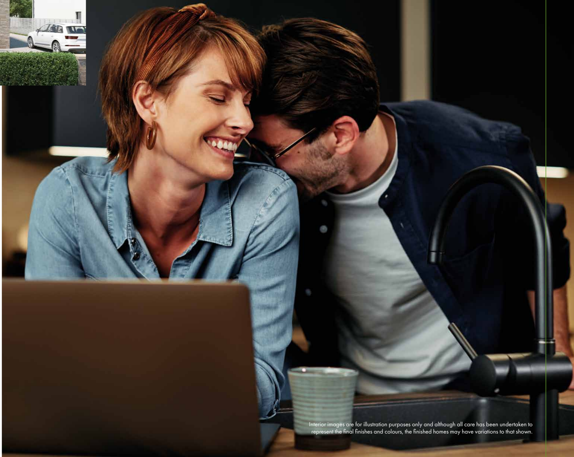
Interior images are for illustration purposes only and although all care has been undertaken to represent the final finishes and colours, the finished homes may have variations to that shown.

INNOVATIVE DESIGN CREATING MAGNIFICENT PLACES TO LIVE AND WORK