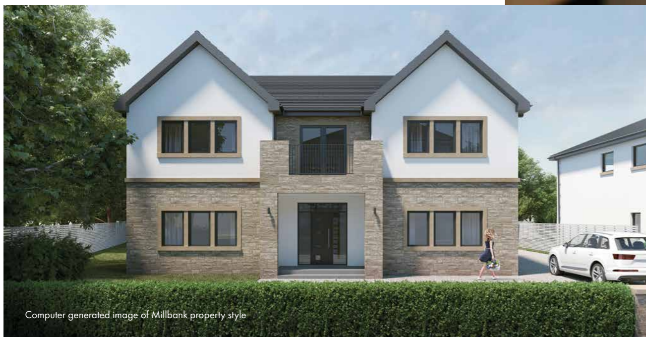
Computer generated image of Millbank property style