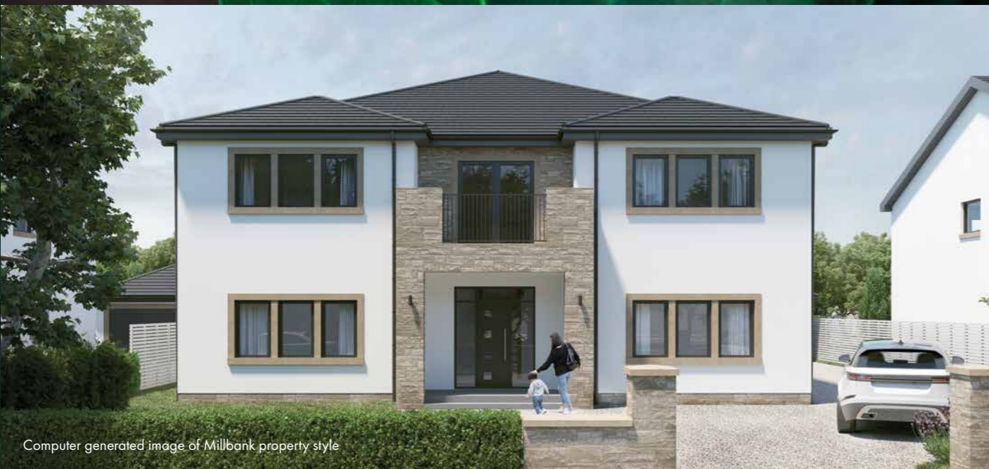
Computer generated image of Millbank property style

Images are for illustration purposes only and although all care has been undertaken to represent the final finishes and colours, the finished homes may have variations to that shown. Sizes are based on maximum measurements and are for indication only. Any intending purchaser should satisfy themselves by inspection or otherwise as to their accuracy. Floorplans have been increased in size for legibility and are not to scale to all other plans within this brochure. Please consult the sales team for more information.