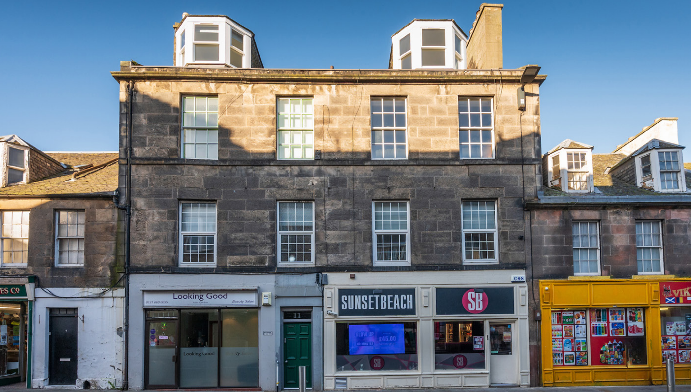
4A, 11 HIGH STREET Dalkeith, Midlothian EH22 1JB